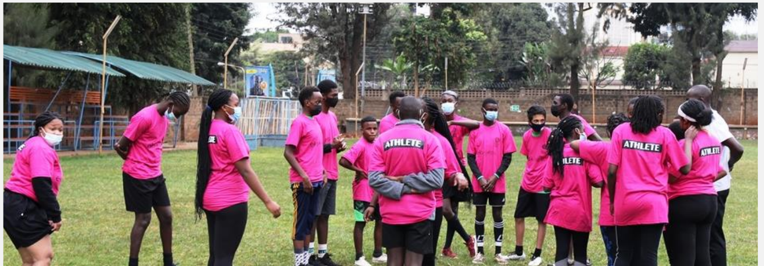
National Special Olympics Floor ball Tournament participants in action