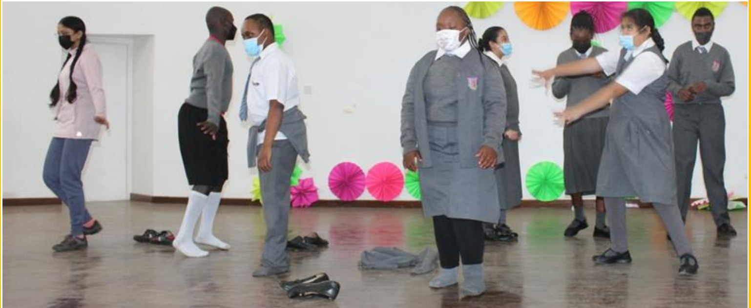
Inclusive Education Department ( I.E.D) Students enjoying a music & dance session