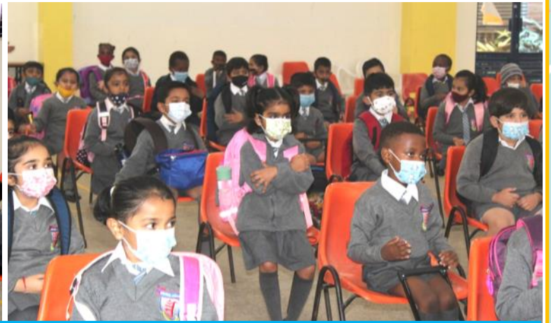
Year 1 Students following orientation proceedings keenly.