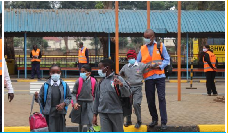
Its Back to School . Staff & Students happy to start the new academic year 2021– 2022. Welcome back All.