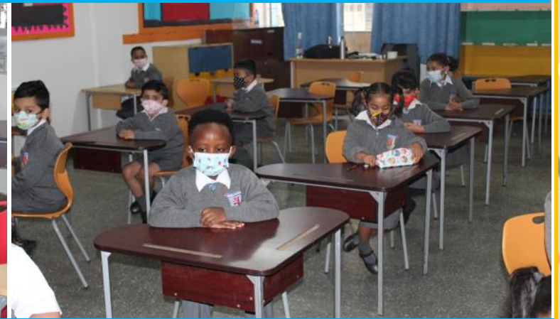
Year 1 Students well settled in their respective classes , ready for Term 1 learning