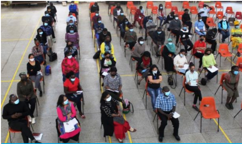
Primary Campus Staff keenly following the briefing from various presentations