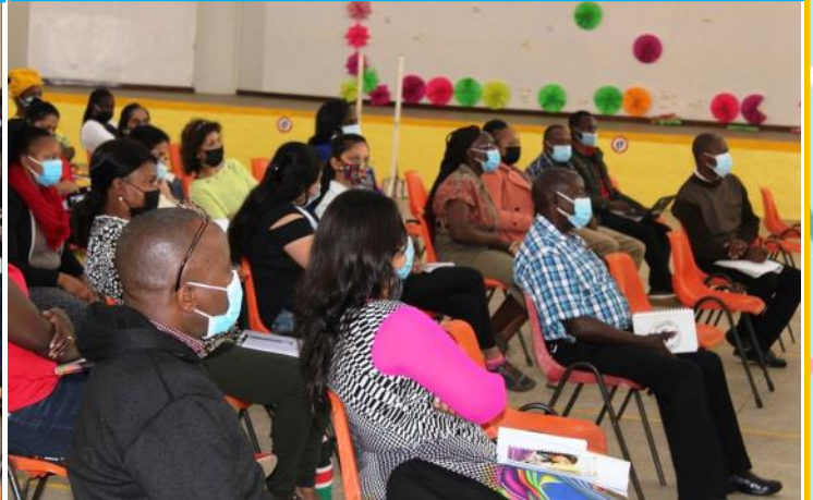
Staff members in staff Training, briefing & orientation session