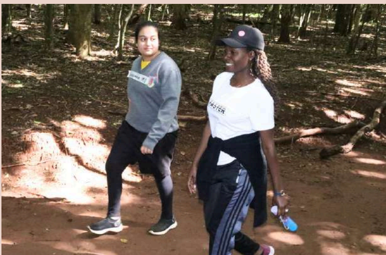
Annual Cross Country