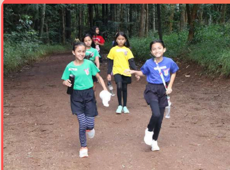
Annual Cross Country