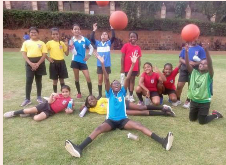
U9 Girls Netball Team