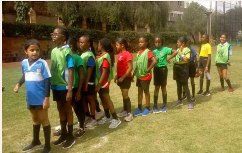
U9 Girls Netball Team Vs Premier Academy