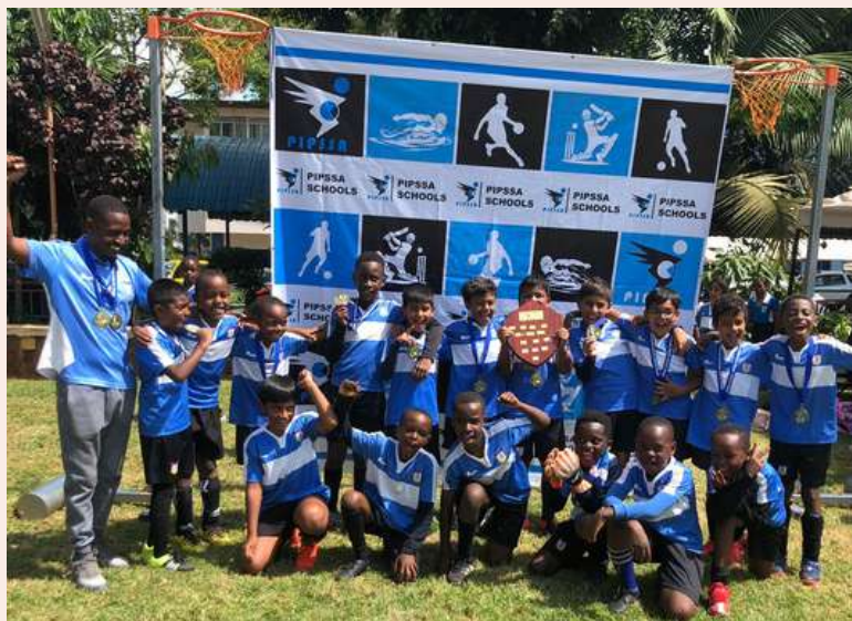
U9 Boys Team at the PIPSSA U9 Boys & Girls Tournament