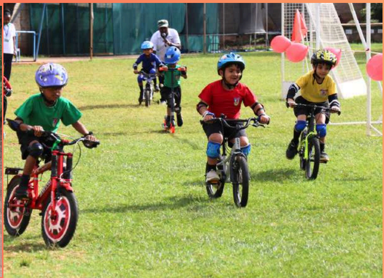
Cyclothon - Year 1 & 2