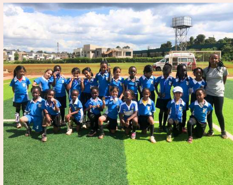
U7 Girls Football Team during U7 PIPSSA Tournament