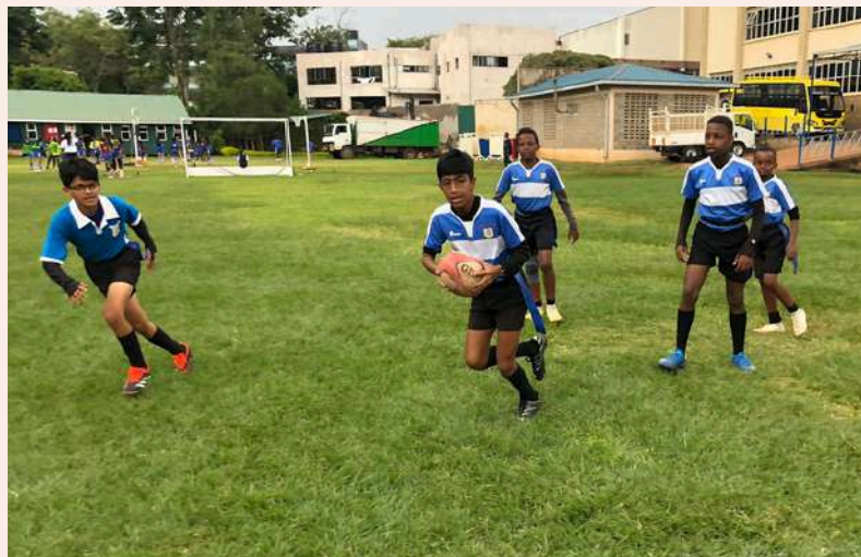
U11 Boys Tag Rugby Team Vs Premier Academy