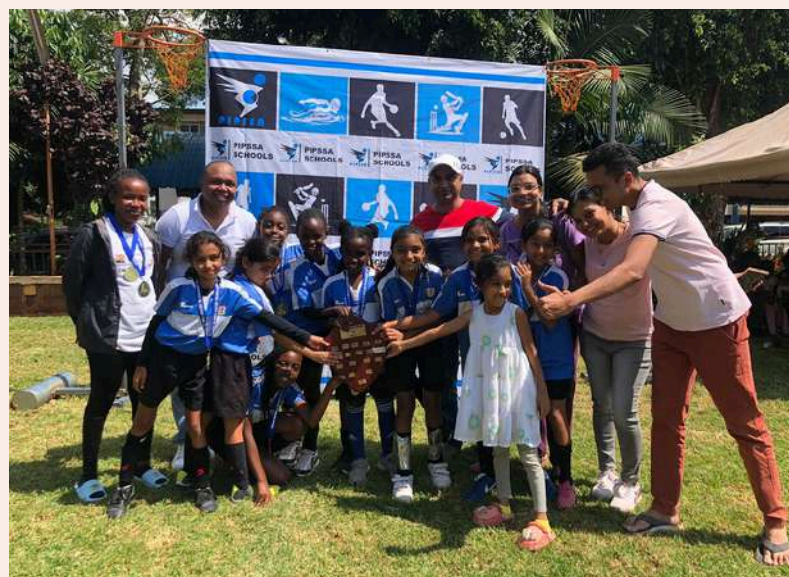
U9 Girls Team during PIPSSA U9 Boys & Girls Tournament