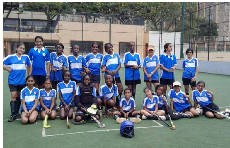
U11 Girls Hockey Team