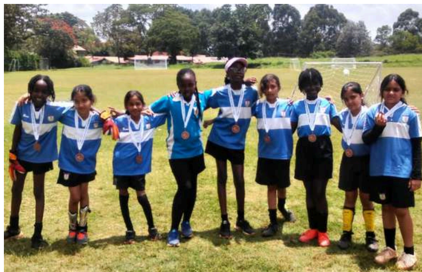
U10 Girls Soccer Team wins Bronze Medal in PIPSSA Soccer tournament