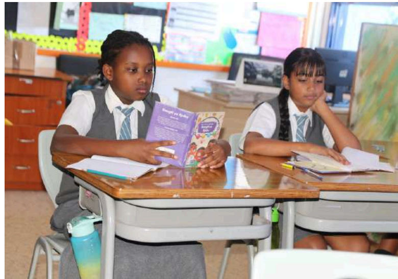
Kiswahili Lesson - Class 5B