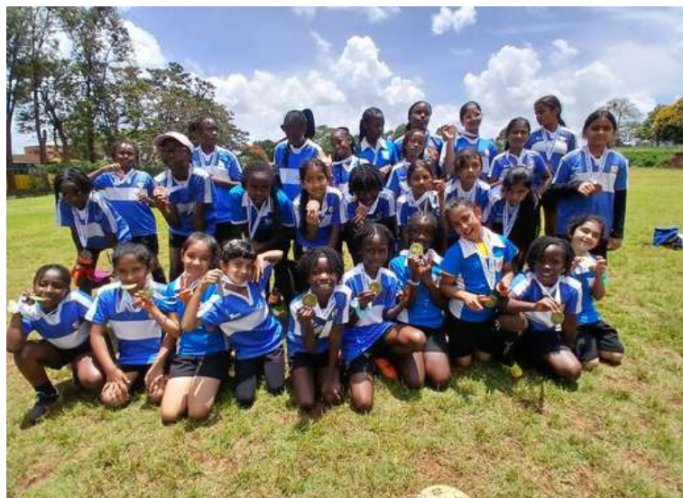
U8, U10, U12 Girls Soccer Teams displays their Accolades