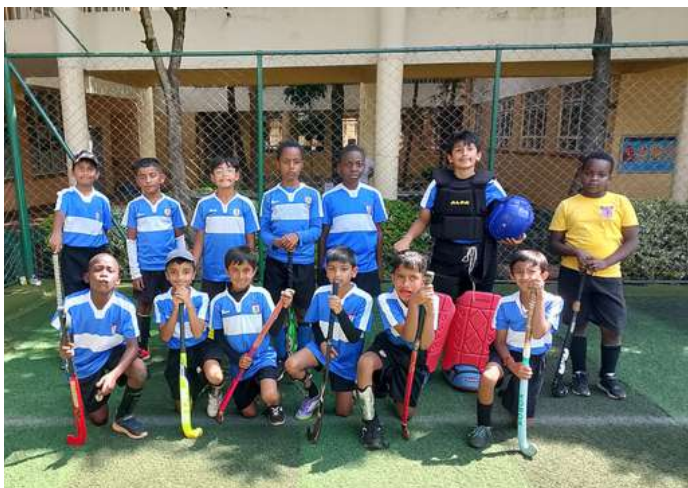
U9 Boys Hockey Team at Rusinga school