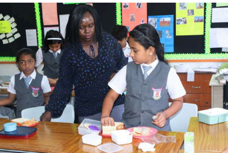
English Lesson - Class 5A