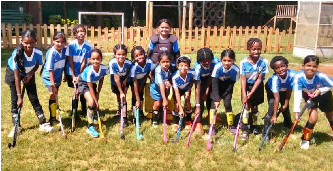
U9 Girls Hockey Team at Rusinga School