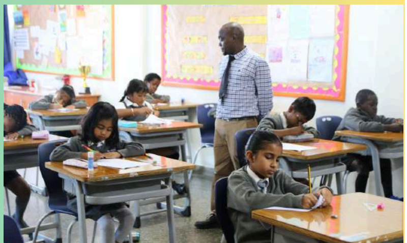
Term End Exam