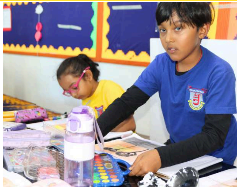
Art Lesson - Class 3B