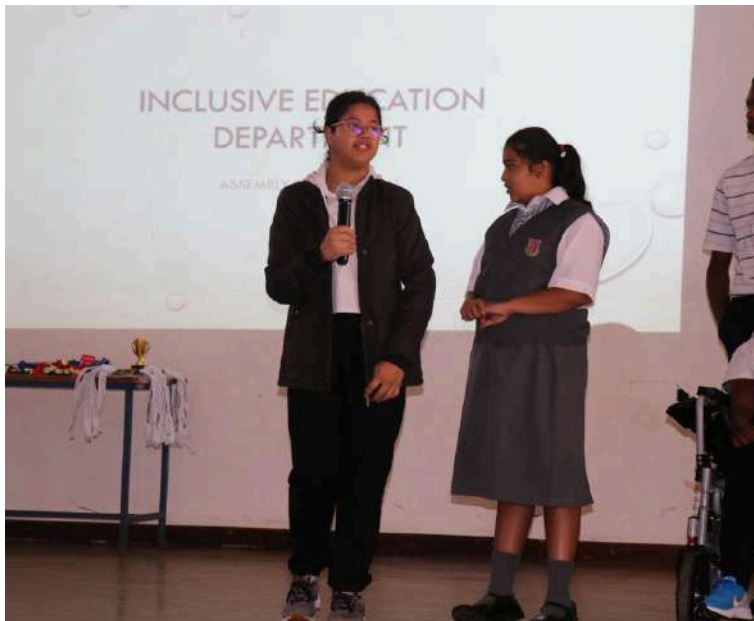
IED - Assembly Presentation